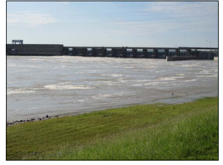
This spring, flooding occurred at locations along many rivers in Kentucky including the Green River, Ohio River and Mississippi River. Photo (above) is of the Cumberland River at Barkley Dam in Western Kentucky.

For more information about flooding and corn, refer to the following publication: