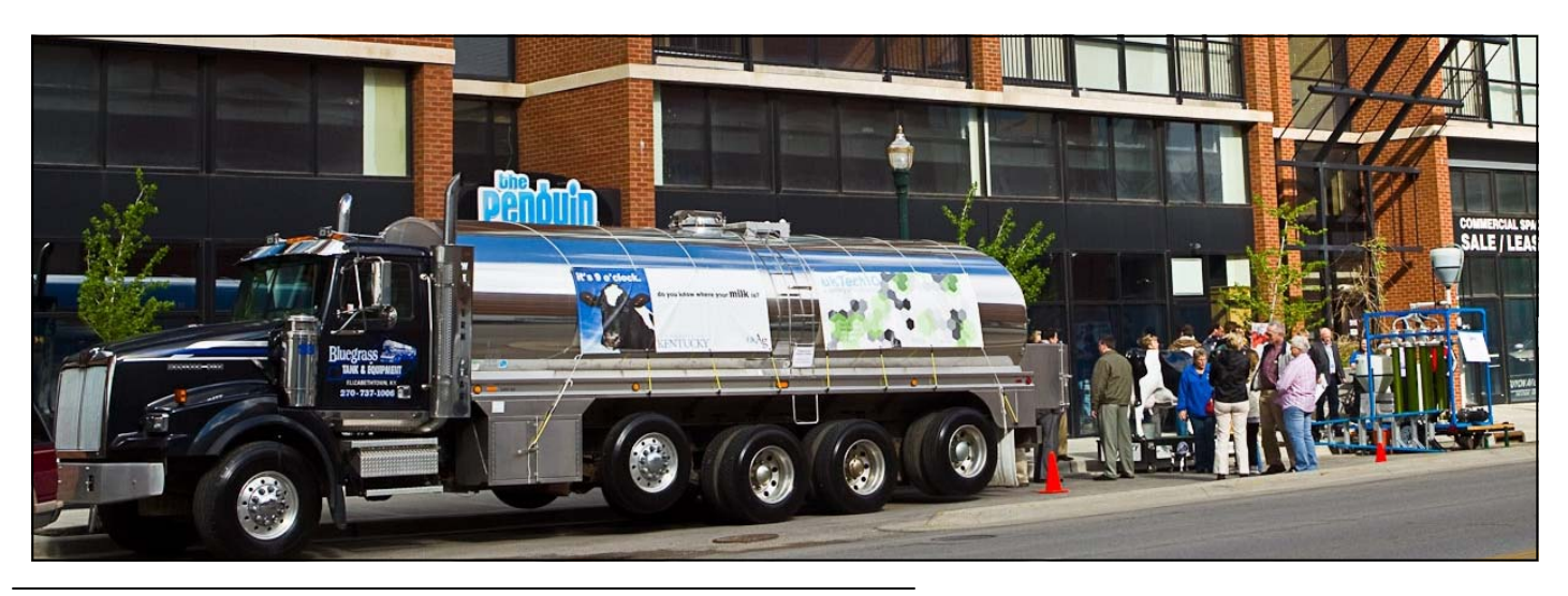
6 — Regulatory Services News, Second Quarter 2010