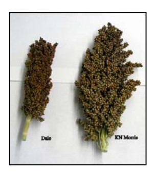
'KN Morris' hybrid sweet sorghum on right, 'Dale' on left.