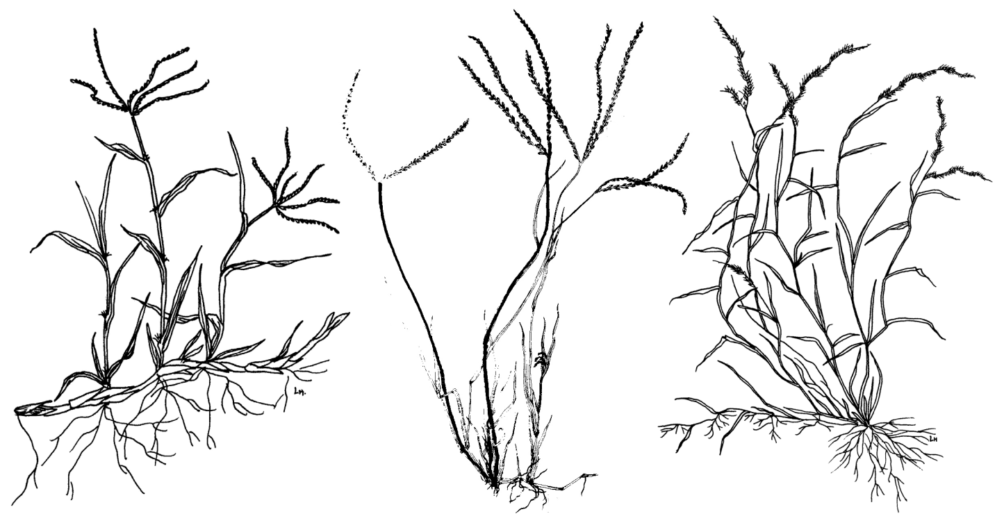
Figure 1. Examples of monocots: bermudagrass (Cynodon dactylon), crabgrass (Digitaria spp.), and nimblewill (Muhlenbergia schreberi J.F. Gmel.).

Most gardens have a mix of annual and perennial weeds plus a few biennials. When you understand the life cycle of troublesome weeds, you can begin to make intelligent decisions about control strategies. Later sections of this chapter examine some of those strategies. Table 2 lists some of our worst weeds by common and botanical names and their life cycles.